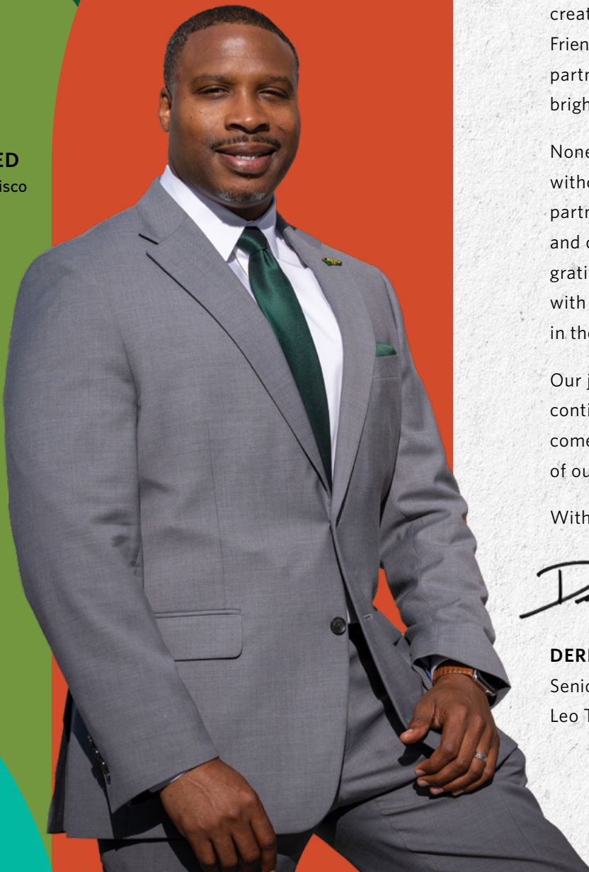
LONDON BREED Mayor of San Francisco

LEADERSHIP AND PROFESSIONAL DEVELOPMENT WORKSHOPS/SESSIONS