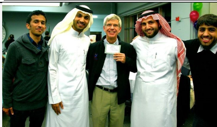
Culturescape, Fall 2011