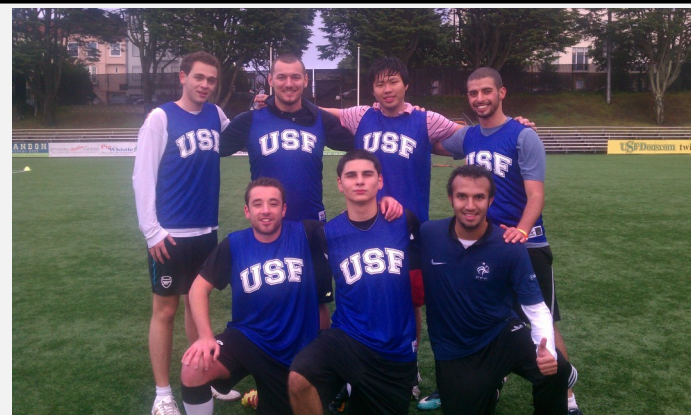
USF World Cup Winning team! Fall 2011

Among the many IEW activities organized at USF, highlights include: the USF World Cup, which brought together five teams of USF international and American students in a friendly soccer tournament, IEW Photo Contest, which yielded 31 inspiring photos; Language & Culture tables hosted by students from the Intensive English Program in Market Café, international myths and legends in the Stories from Around the World event, a panel discussion on Internationalization efforts at USF, and the International Student Association's (ISA) annual signature event, Culturescape, an evening of performances, music, and food from all around the world.