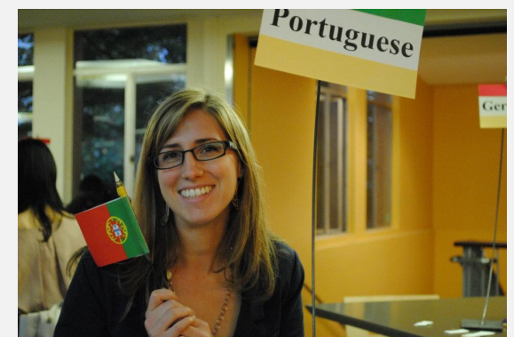
Language and Culture Tables, Fall 2011