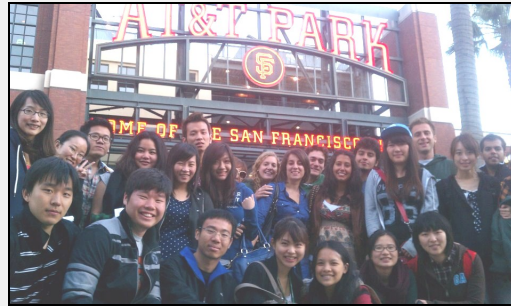
INP members at AT&T park, Fall 2011

hoods, North Beach. Please check the INP website in January for a full list of the upcoming activities for the Spring 2012 semester: http://www.usfca.edu/iss/inp/