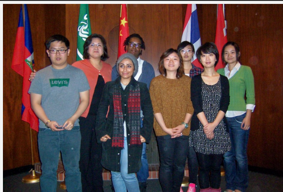
Stories from Around the World, Fall 2011