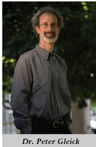
Dr. Peter Gleick

MacArthur "genius" fellowship and was dubbed a "visionary for the environment" by the British Broadcasting Corporation. Dr. Gleick is a member of the National Academy of Sciences and