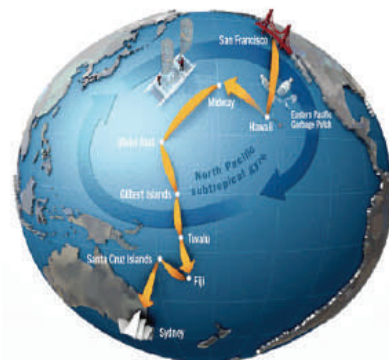
Route of Plastiki's projected voyage

Students in the Senior Capstone Seminar class will be supporting the expedition's goals by developing content for the expedition's website. Students are working on translating complex issues, like rising sea levels and ocean acidification, into text and diagrams that can be easily understood by anyone without scientific training. Students are also doing research to produce profiles of each of the expeditions major stopping points that will describe the specific ways in which each location will be impacted by the various threats to marine ecosystems being highlighted by the expedition.