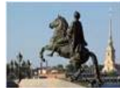
Statue of Peter I, St. Petersburg

The conference provides...a great opportunity for...U.S. law librarians in attendance...to engage with each other at a deeper level.