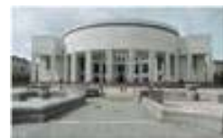
The Russian National Library