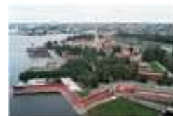
St. Petersburg, Russia